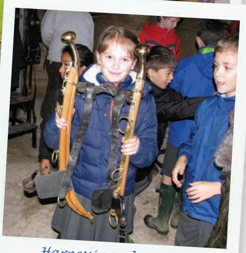
Harnessing a horse, the way it would have been done 100 years ago