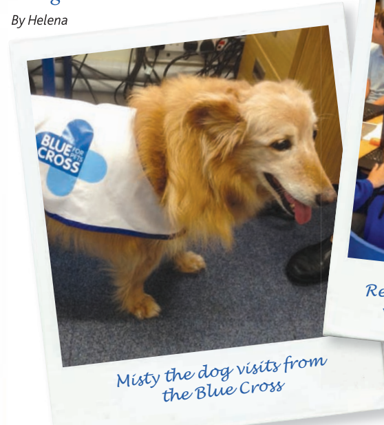
Misty the dog visits from the Blue Cross