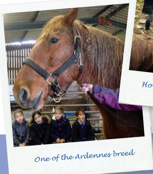
One of the Ardennes breed