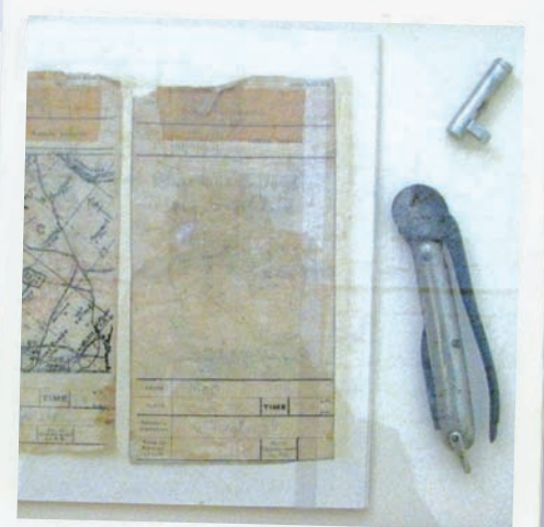
An actual message carried by a pigeon in the First World War, with the carrying canister