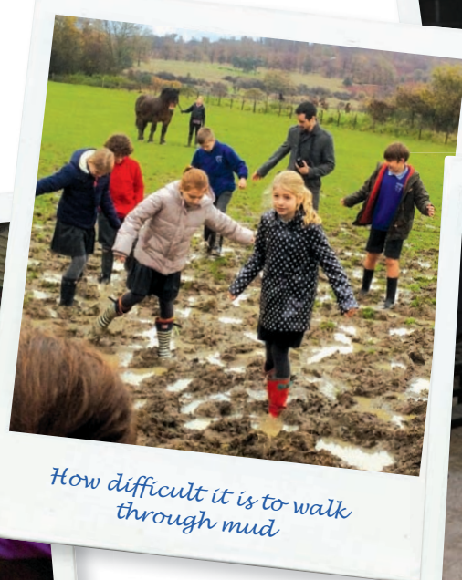
How difficult it is to walk through mud