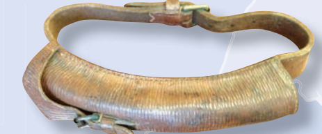
Dog collar for carrying messages