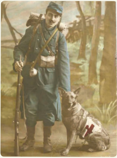
French soldier with a mercy dog

Dogs were amongst the most reliable and hardest workers. They had lots of different roles including: casualty dogs, messengers, sentry dogs, scout dogs and those that laid wires.