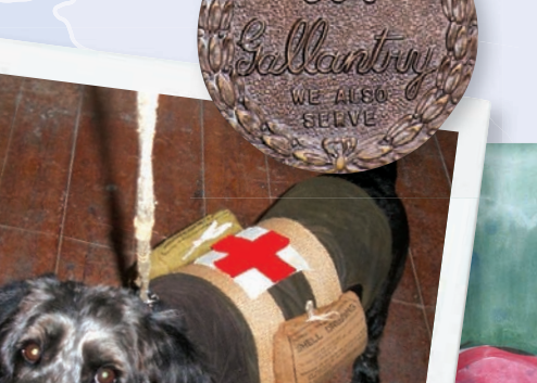
Star the mercy dog, visiting the class at Redoubt Fortress and Military Museum, Eastbourne