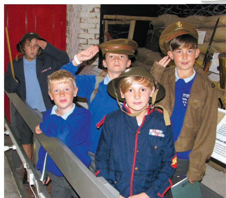
Trying on different military uniforms next to the World War One replica trench